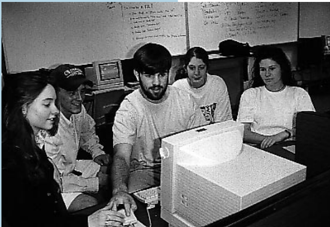
Students with learning disabilities can benefit from using different kinds of tools that stimulate and support the writing process. Pictured is a group of students writing a multimedia story using Hypercard™ software.

Multimedia can support writing in a number of ways. It can help students deepen conceptual understandings. It can engage their prior knowledge and help them form mental images. It can also provide tools for composing and publishing. Perhaps most importantly, it can ease the transition from concepts and images to words.